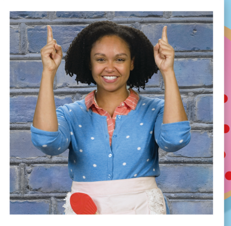
to the Lord,