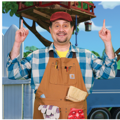
of the Lord