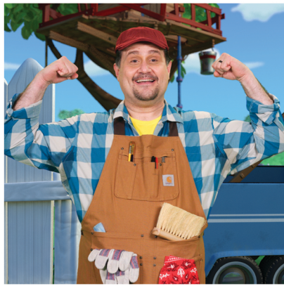
"And the power