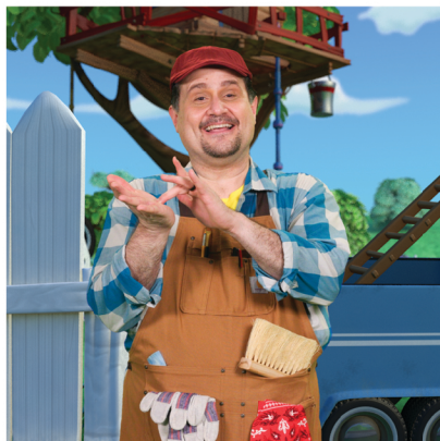
was with Jesus."