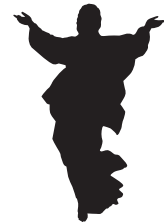
APPEARANCE #11 Jesus' Final Appearance And Ascension