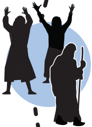
APPEARANCE #10 Jesus Commissions The Disciples