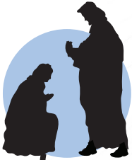
APPEARANCE #1 Jesus Appears To Mary Magdalene

There is a difference between hearing about Jesus and encountering him for yourself.