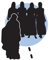
APPEARANCE #2 Jesus Appears To The Other Women

There is a difference between hearing about Jesus and encountering him for yourself.