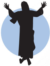
APPEARANCE #9 Jesus Appears To James